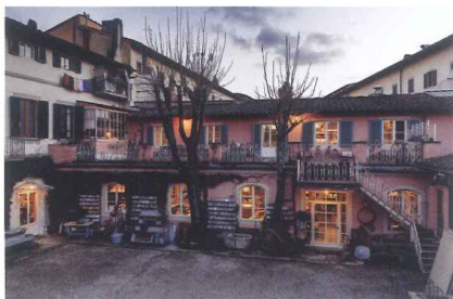
Above: Desinare cooking school and event venue in Oltrarno, Florence