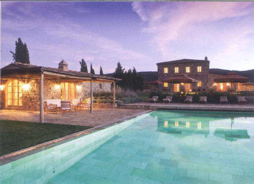
Above: Villa Alba at Castiglion del Bosco in Tuscany. Below: Galápagos Safari Camp on Santa Cruz