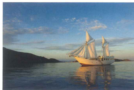
Above: the Alexa boat cruising around the Indonesian archipelago

(all-inclusive three-night charters from $9,000). There's also NEW YORK , where this month an unusual adults-only pop-up hotel opens during the Frieze Art Fair, which runs May 8-12 on Randall's Island Park ( www.friezenewyork.com ). Al's Grand Hotel (rooms from £350) will be located inside the main Frieze tent (which holds a Guinness World Record as the largest single-unit marquee), and is a reimagining of a pop-up created